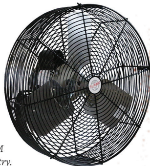
Highest CFM in the industry.