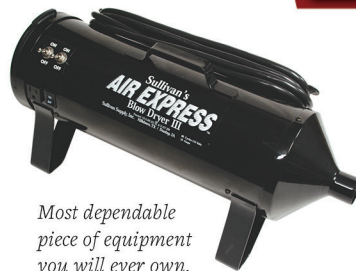
Most dependable piece of equipment you will ever own.