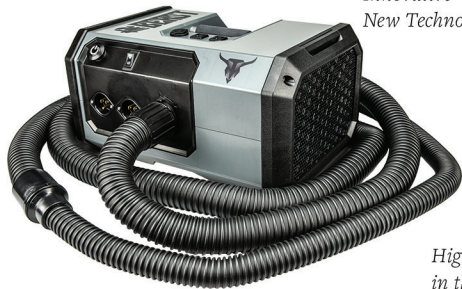
The Beast Blower, Innovative New Technology