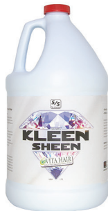
Highest Quality Sheen